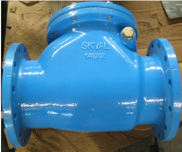
Swing check valve