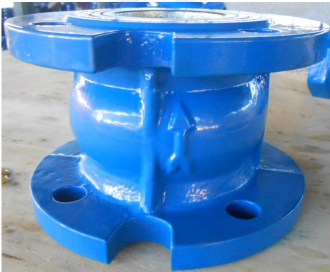
Flange silent check valve